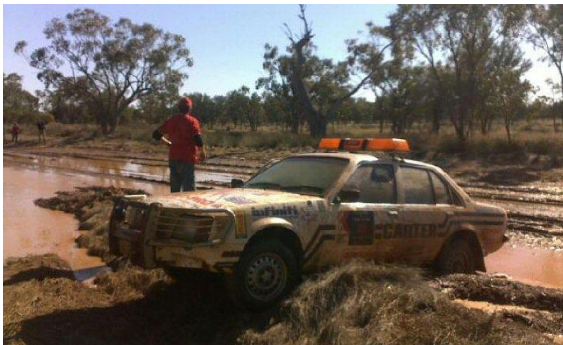
A "wet" KKR 2010 – Kar 48 – Carterttack

Entry list will be updated regularly on the website