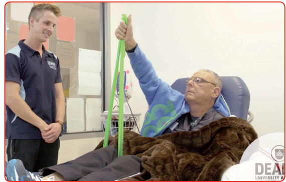
Straight arm shoulder flexion