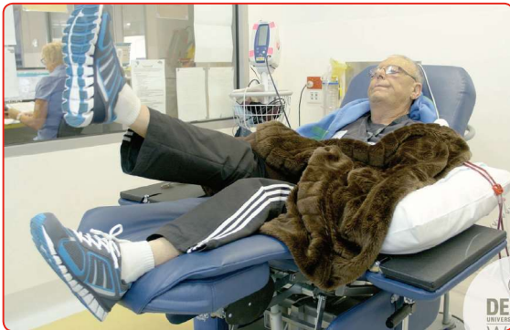
Straight leg raise