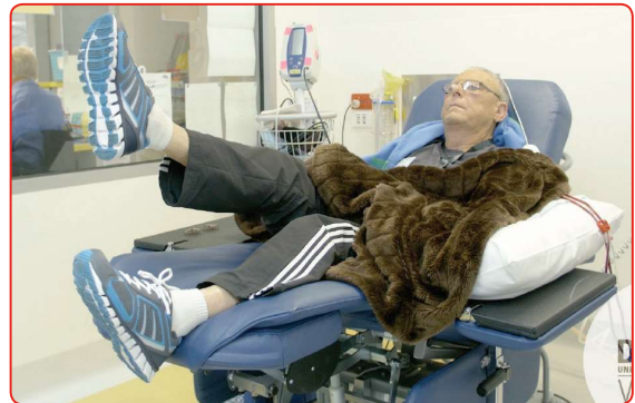
ABC drawing with toes